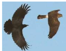
Above: A hen harrier, seen trying to hunt over the reed beds near white bridge. The local crows don't tolerate its presence there.