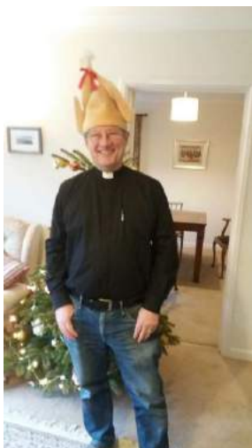
Photographs from Friends' article -