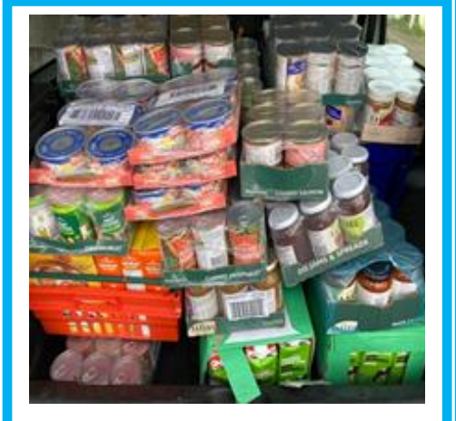
Stock provided by Exmouth Food Bank to support the Pop-Up Pantry in Budleigh