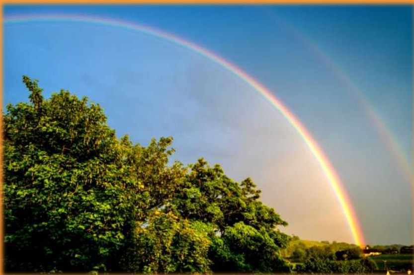
Rainbow over East Budleigh

Thank you to everyone who helped make this year's Scarecrow Festival another amazing success!