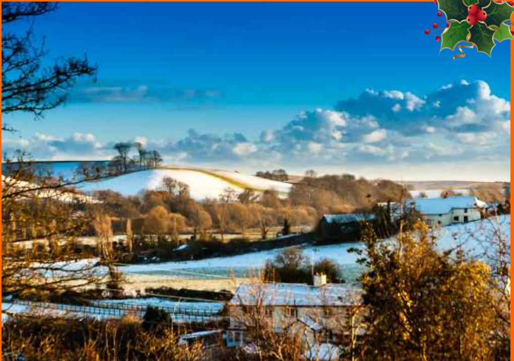
A cold view over the Otter Valley.