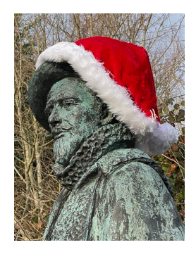
Sing your favourite Christmas Carols A free community event - All welcome!

4-5pm Wednesday 13 December at the Sir Walter Raleigh Pub