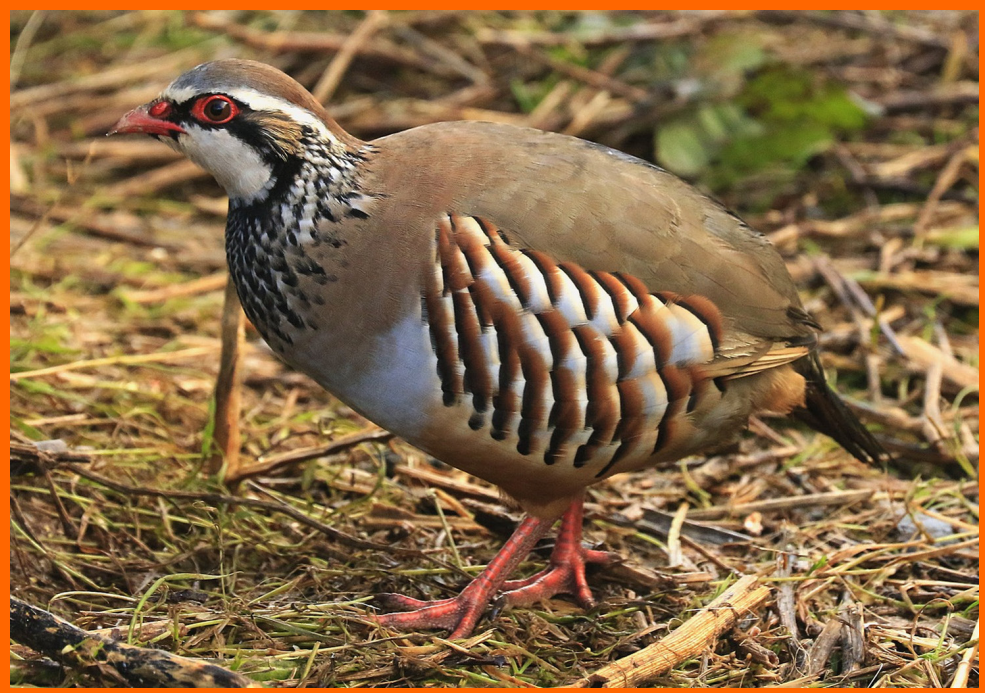
Red Legged Partridge (in search of a Pear Tree?)