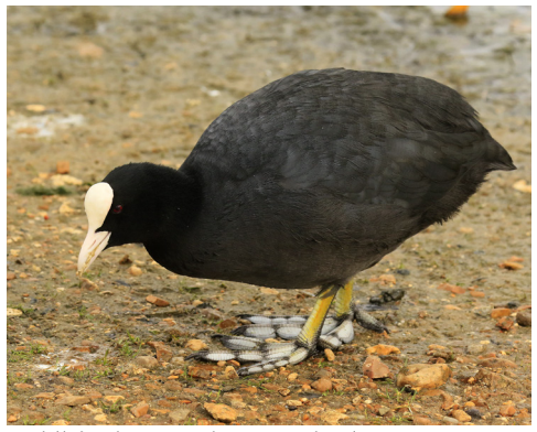
Wildlife Photographs - David White