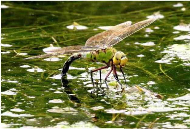
An Emperor dragonfly laying eggs.

A couple of what superficially looks like black headed gulls - the one in the foreground is, but the other has a jet black, not dark chocolate coloured head, a heavier & bright red beak & all white wing tips - this is a Mediterranean gull. An uncommon visitor to our area. The side by side shot makes for easier identification.