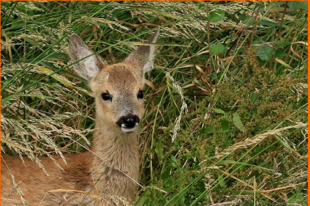
Local visitor - a roe deer fawn.