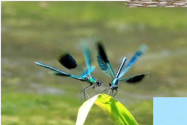
Male banded demoiselles

We are lucky to have a few pairs of swift breeding near the edge of our village