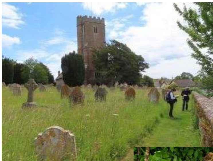
Our beautiful churchyard