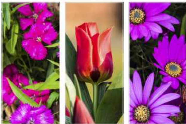
A triptych of East Budleigh garden flowers by Peter Bowler