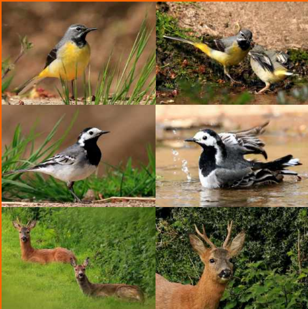
Grey & Pied wagtails on East Budleigh brook, & deer in a field in the village.