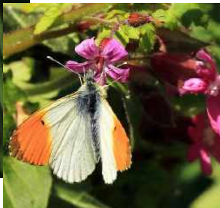
Churchyard visitors