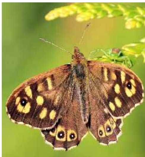
A visitor to the churchyard