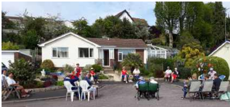
Orchard Close VE Day street party... from a safe distance. See page 24 for another picture. Diane White