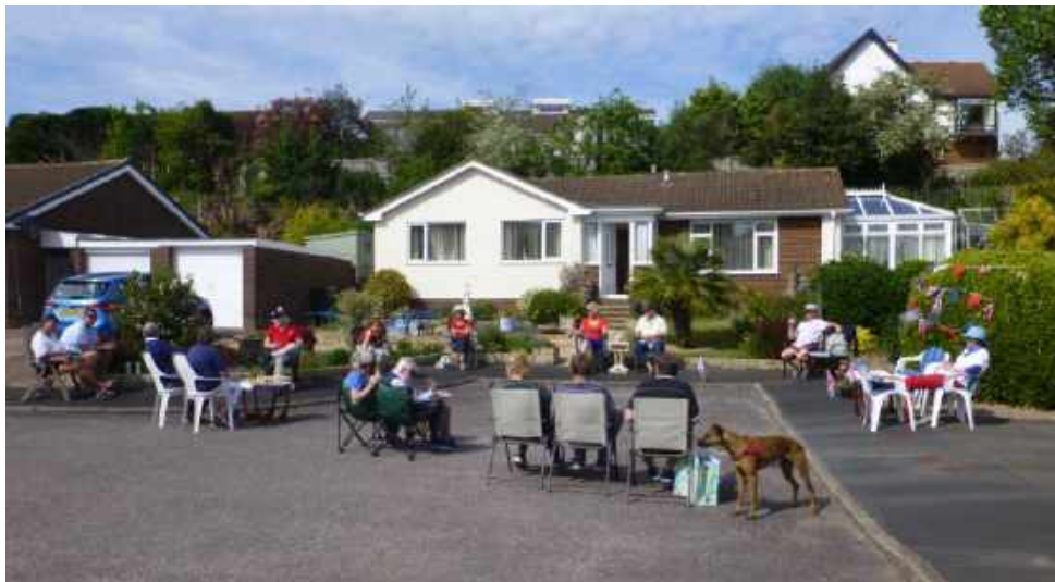
Late afternoon in May, East Budleigh