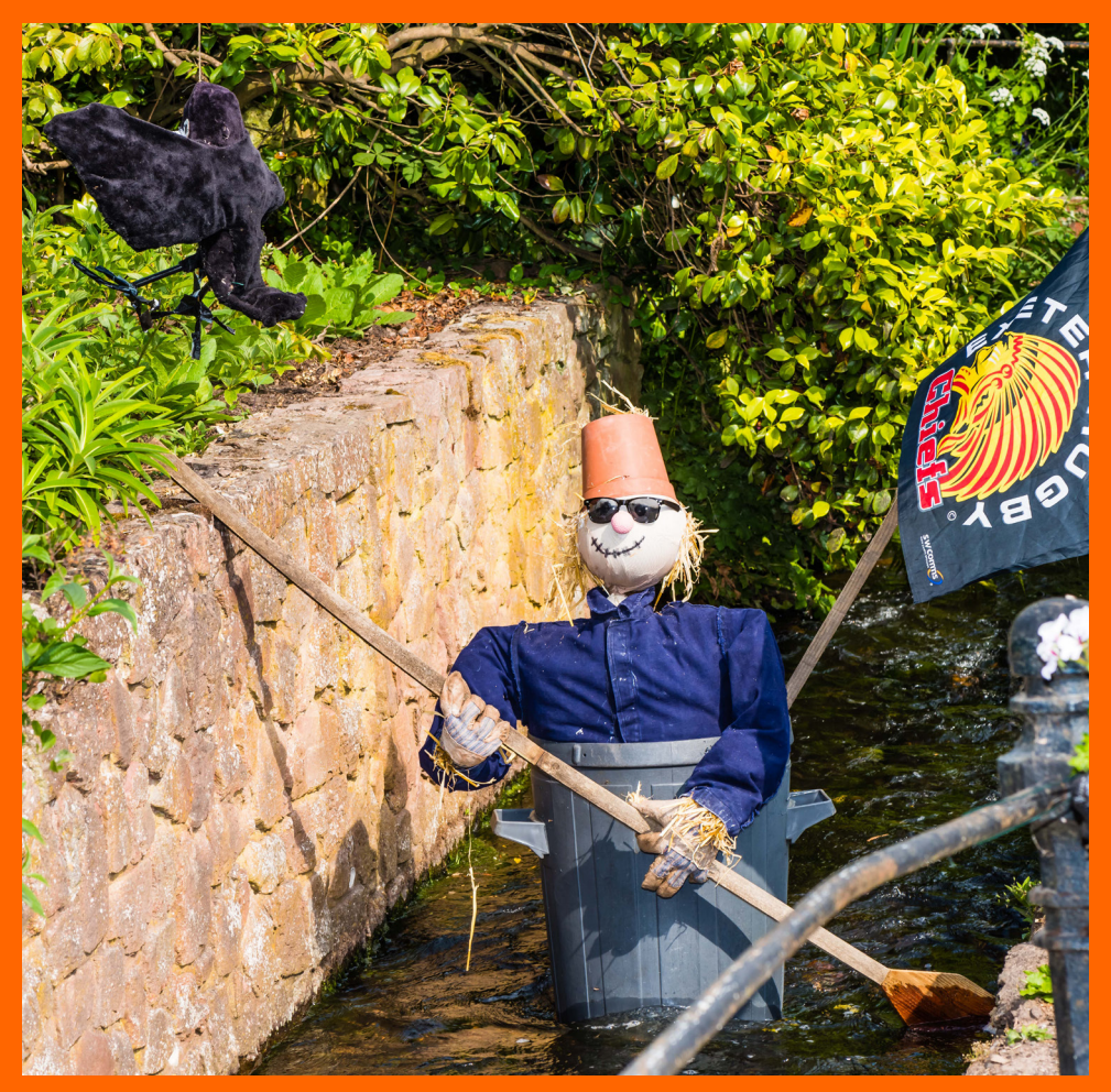
Scarecrow Festival