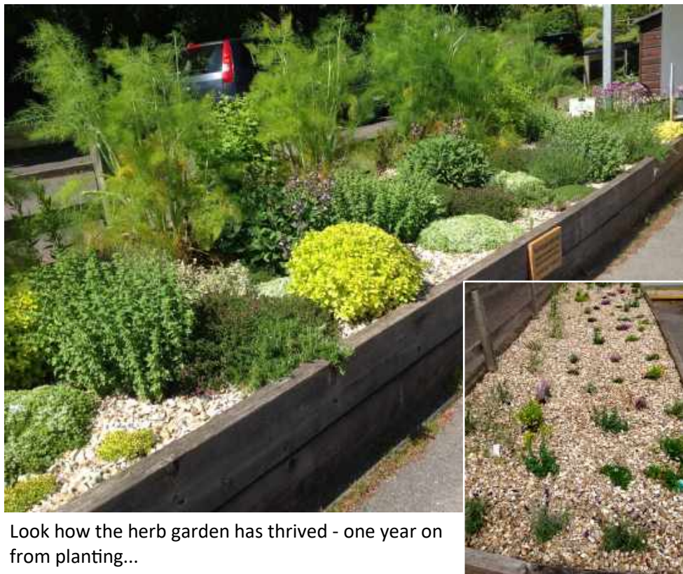
Look how the herb garden has thrived - one year on from planting...