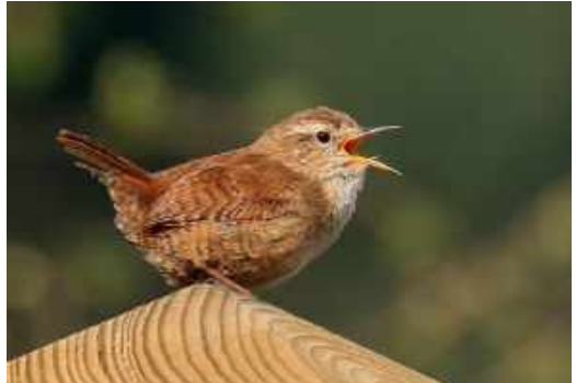
Clockwise; Little ringed plover, a Turnstone moulting into its breeding plumage, an otter, a Dartford warbler, a singing little wren, a greenfinch eating a blackthorn flower and a yellowhammer.