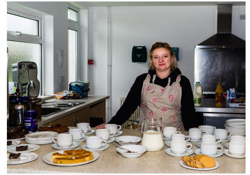
Little Otters Jumble Sale