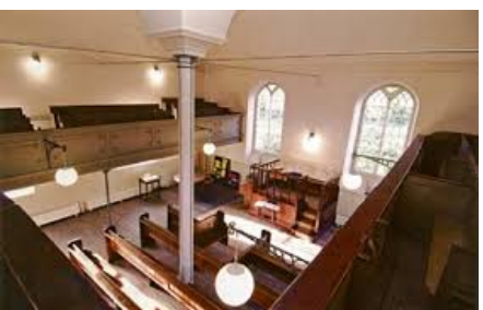
Too important to lose.....