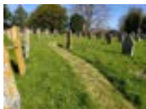
New grass pathway in Churchyard

[Photo] The Churchyard Working Party enjoying the coffee break in the sun.