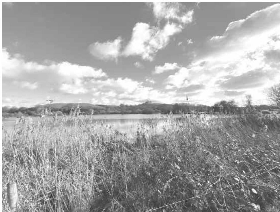
A walk by the old railway line