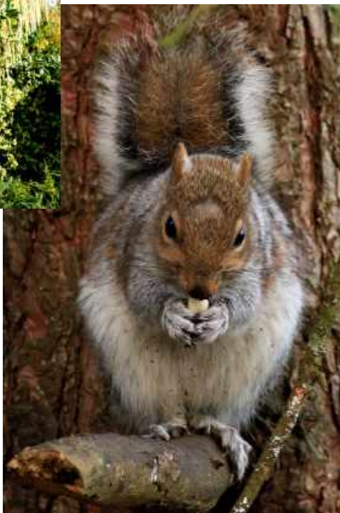
This squirrel removed the skin from the peanut before eating!

The unfortunate mole was trying to escape rising flood water. When it came to the surface, a hungry heron was waiting!