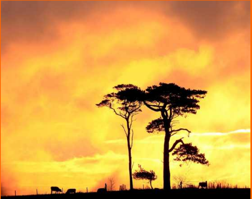
Silhouettes at sunrise by the River Otter.