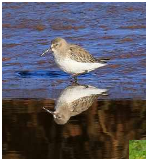
Dunlin & reflection