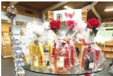
On sale at Bicton Gardens

It was a grey and overcast day when bright red hearts sprung up all over the Village notifying the upcoming arrival of the Valentine's Day Gifts organised by the Friends of All Saints. Orders flowed in, roses were bought and three teams worked to make up over 50 gifts and deliver - in flurries of snowflakes! It was lovely to see the surprise and smiles on faces. The event raised over £100 but more importantly spread a little love and joy, totally priceless. Thank you for your support.