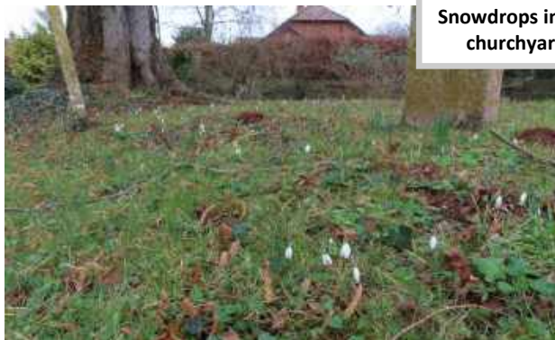
Snowdrops in the churchyard