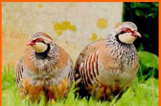
Wildlife in the churchyard